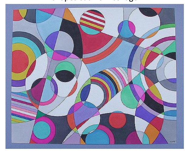
Option 2: Create a realistic collage using only geometric shapes